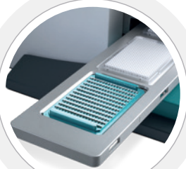
new magnetic plate for reliable miniaturised SPRI bead clean-ups