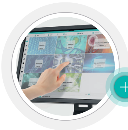
protocol wizards for fast and easy set-up