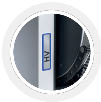
new ergonomic design features

Our mosquito genomics has been the popular choice for NGS labs and core facilities wanting to miniaturise reaction volumes and maximise productivity. Now we are making your favourite pipetting robot even better. mosquito genomics is available with a host of new and exciting features and upgrades: